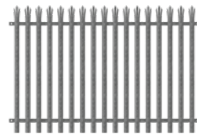
Trident Top Panel