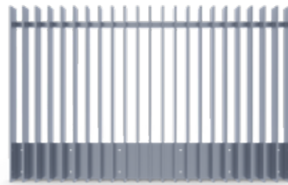
Postless Balustrade Panel