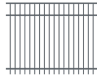
1.5mH / 1.8mH Flat Top Panel